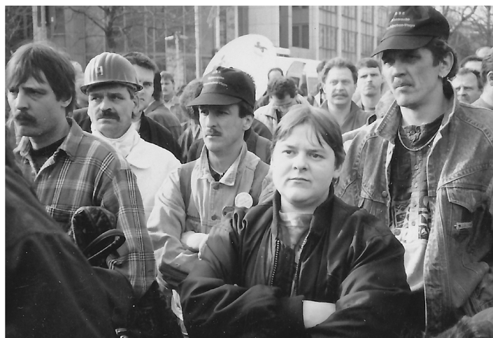
1997: Miners on Strike in Bonn (Germany)

No wonder that those in power view this development with concern. Already at the beginning of the movement the CSU in Bavaria, the FDP (Free Democratic Party), and the Association of German Criminal Officers in North Rhine-